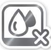
WATER DUST PROOF