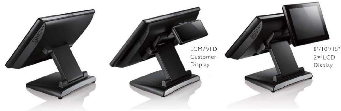
LCM/VFD Customer Display