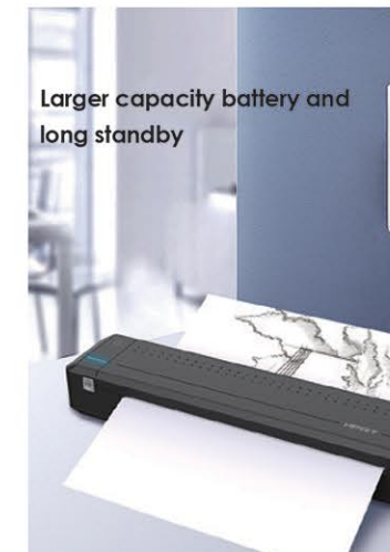
Larger capacity battery and long standby