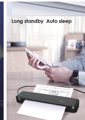
Long standby Auto sleep