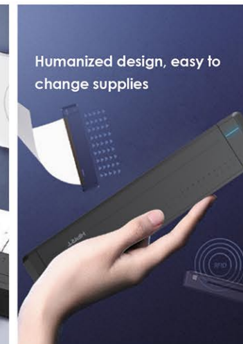
Humanized design, easy to change supplies