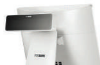
Customer Display • VFD (2 Lines x 20 Characters)