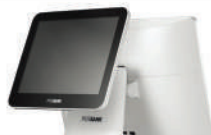
2nd Display • 9.7", 12.1", 15" LCD